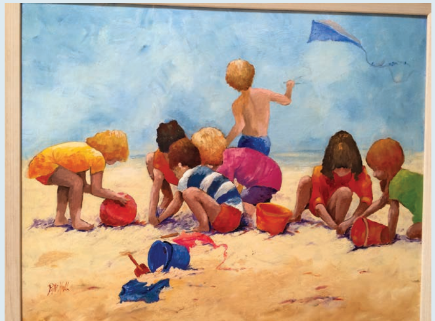
◀ Me 'N' Dad

Acrylic, based on photograph of grandchildren and friend's grandchildren ▼