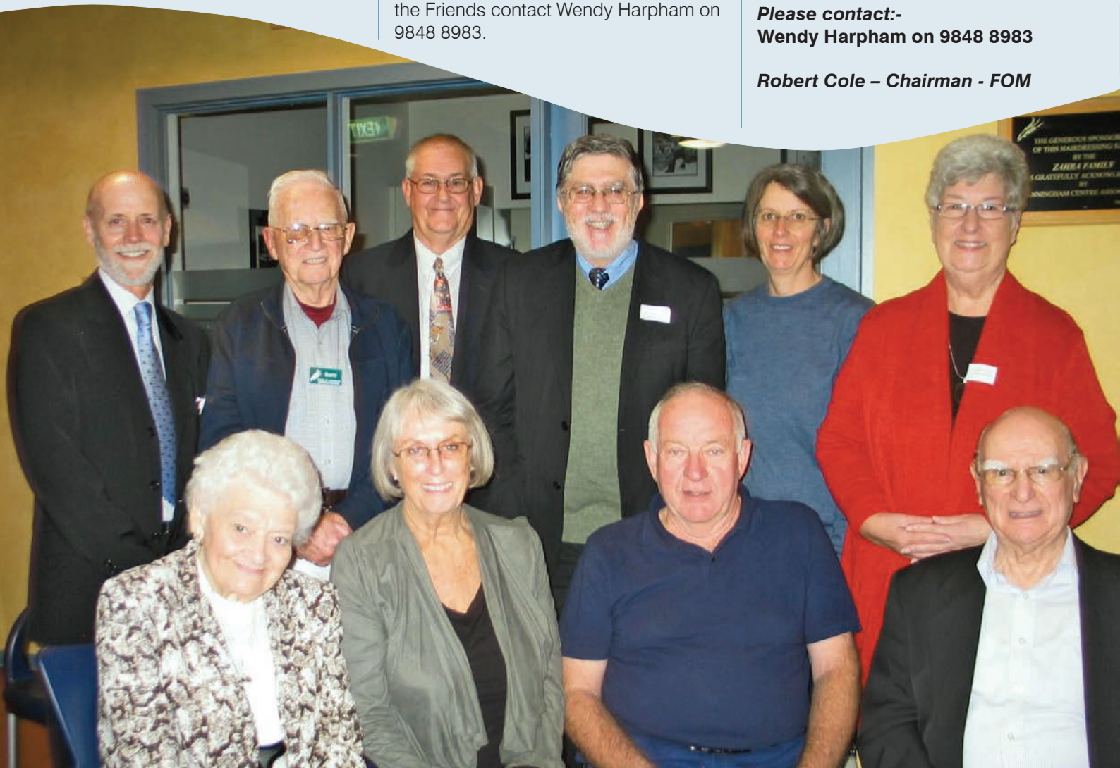
Friends of Manningham Supporting Relatives Committee