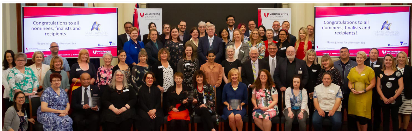
▲ All nominees, finalists and recipients, including the MannaCare team!