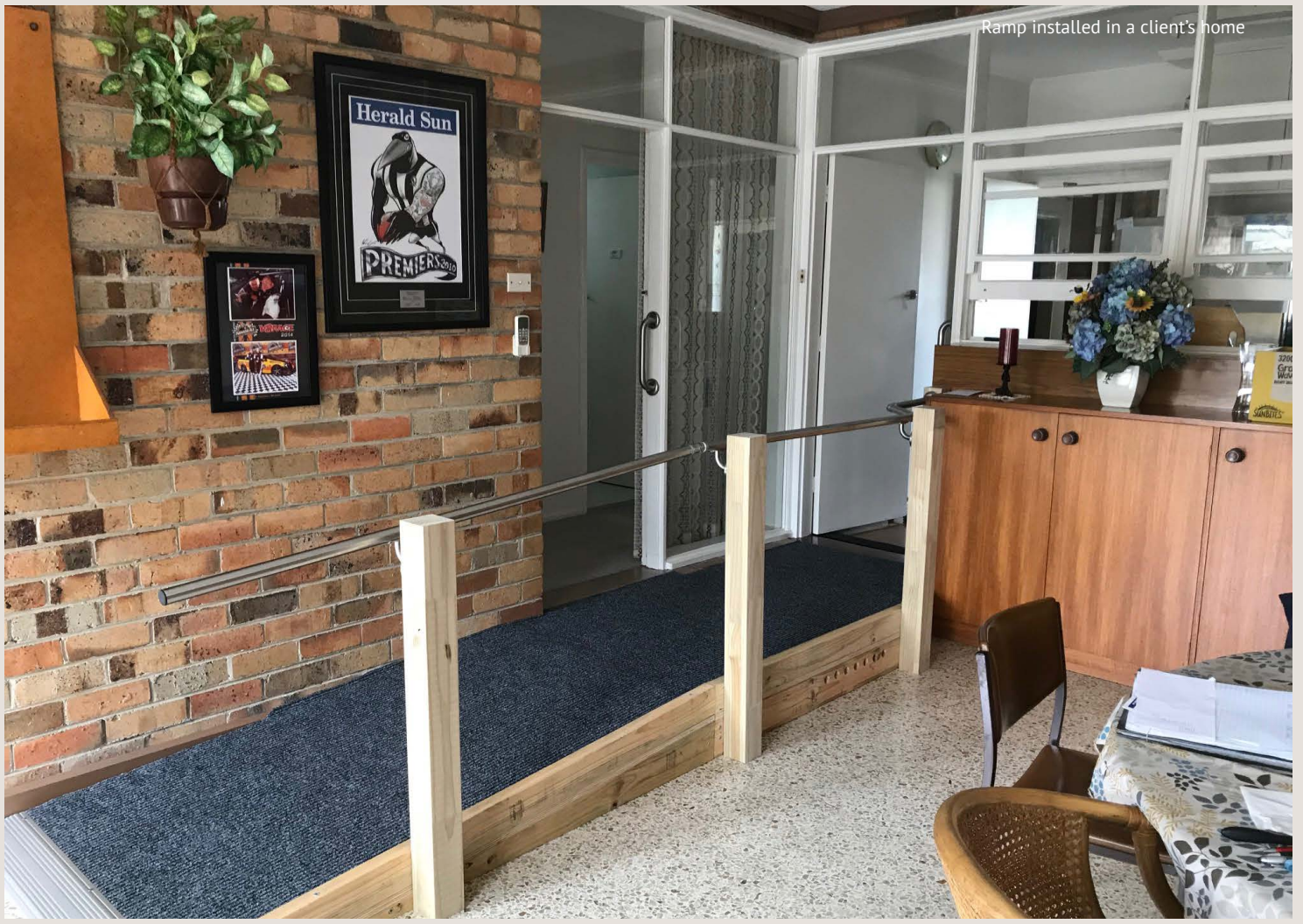
Ramp installed in a client's home